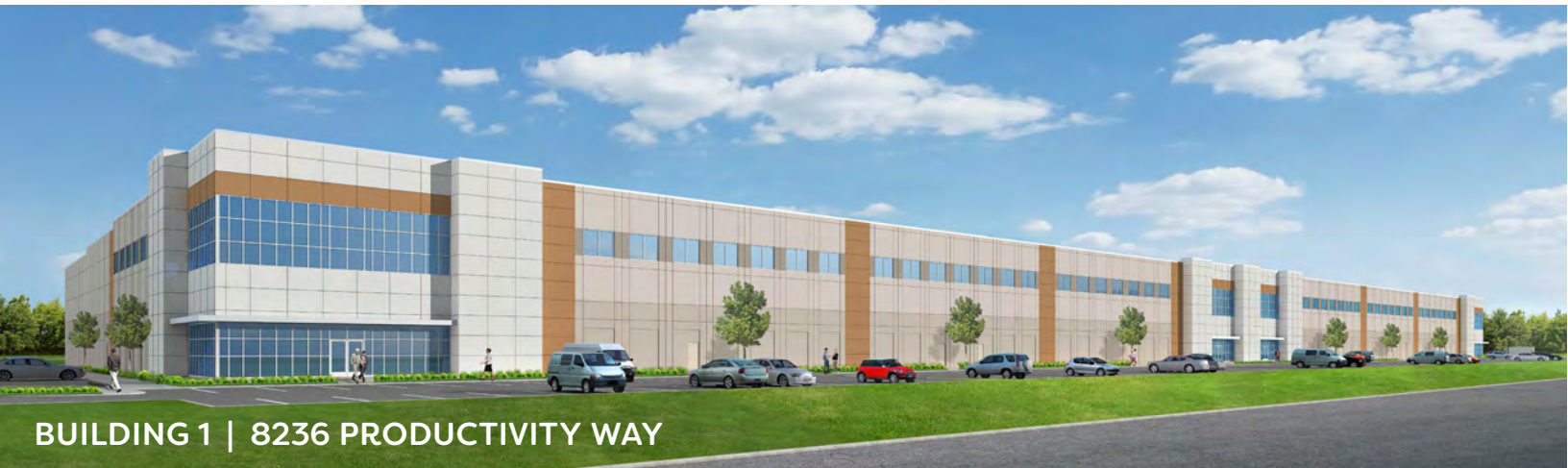
BUILDING 1 | 8236 PRODUCTIVITY WAY