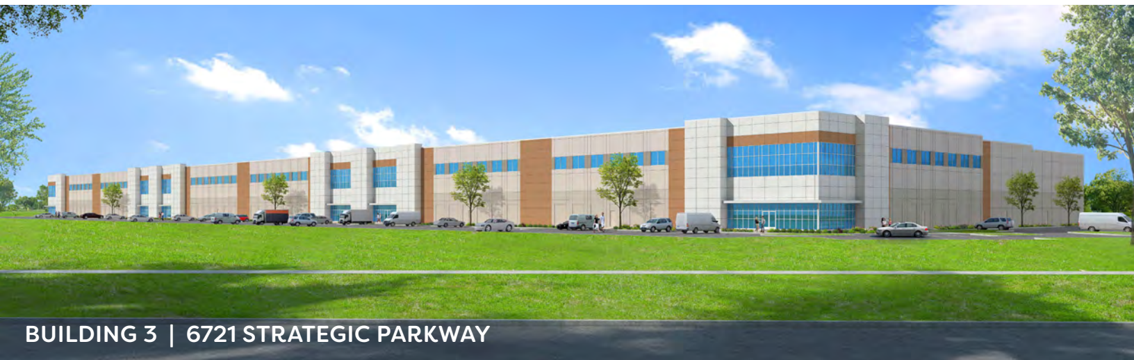
BUILDING 3 | 6721 STRATEGIC PARKWAY

Camby Road & Kentucky Avenue Indianapolis, IN 46113